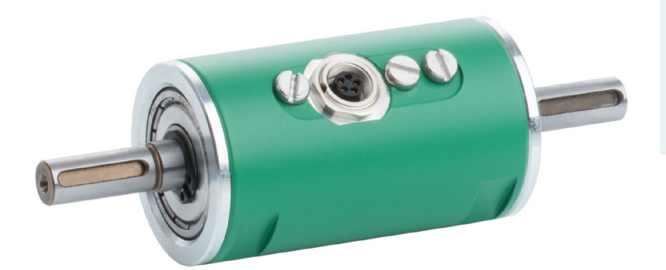
Model 8645 with round shaft